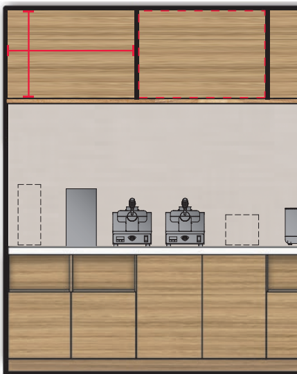
Solid Cabinet with Doors that DO NOT Touch: Measure entire panel or door, no adjustments