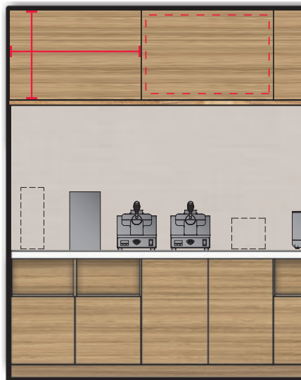
Solid Cabinet with Doors that Touch: Measure entire panel or door, then subtract 1" to 1.5" from height and 1" to 1.5" from width